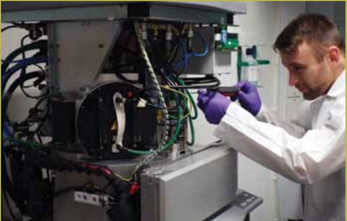
Hands-on experience changing a sputter magnetron

The programme taught modules have an element of professional development planning embedded within their content, enabling skills development beneficial to future employability.