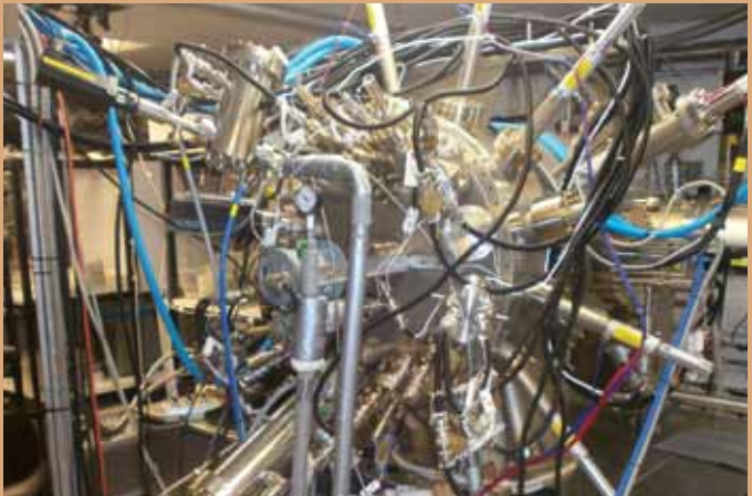
Molecular Beam Epitaxy deposition system